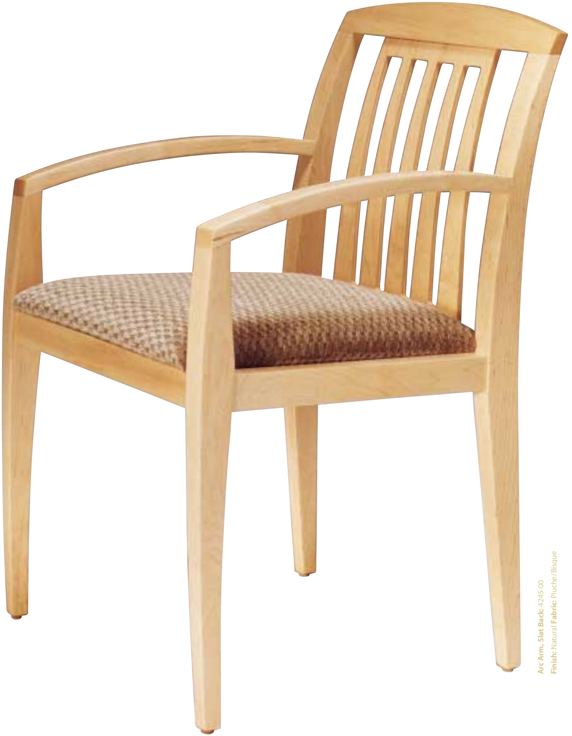
Arc Arm, Slat Back: 4245-00 Finish: Natural Fabric: Pluche/Bisque