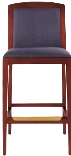
Armless Upholstered Back: 4049-00 Finish: Mahogany Satin Fabric: Esoteria/Tarot