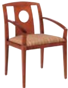
Cascade Arm, Circle Back: 4147-00