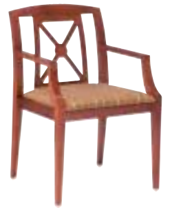
Repose Arm, Cross Back: 4246-00

Finish: Amber Cherry Fabric: Arran/Macrie