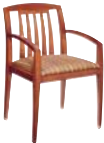
Arc Arm, Slat Back: 4245-00

Designed for hotels, airports and lunch counters, the stool is a welcome addition to the Composites Seating family. With either a slat or upholstered back and a brass kick-plate for heels, the stool brings attractive furnishing to new heights.