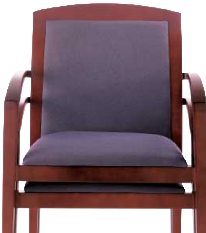
Upholstered Back: 4043-00 Finish: Mahogany Satin Fabric: Esoteria/Tarot

Finish: Amber Cherry Fabric: Arran/Macrie