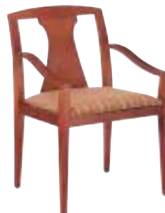
Contour Arm, Hourglass Back: 4148-00