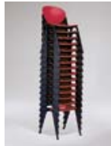
Stacking Non-Mobile Armless: 15 high/floor, 12 high/dolly Non-Mobile w/Arms: 5 high/floor Mobile Armless: 12 high/floor, no dolly needed Mobile w/Arms: 4 high/floor