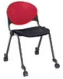
Red w/Upholstered Seat N45LLU w/Casters N45EEU