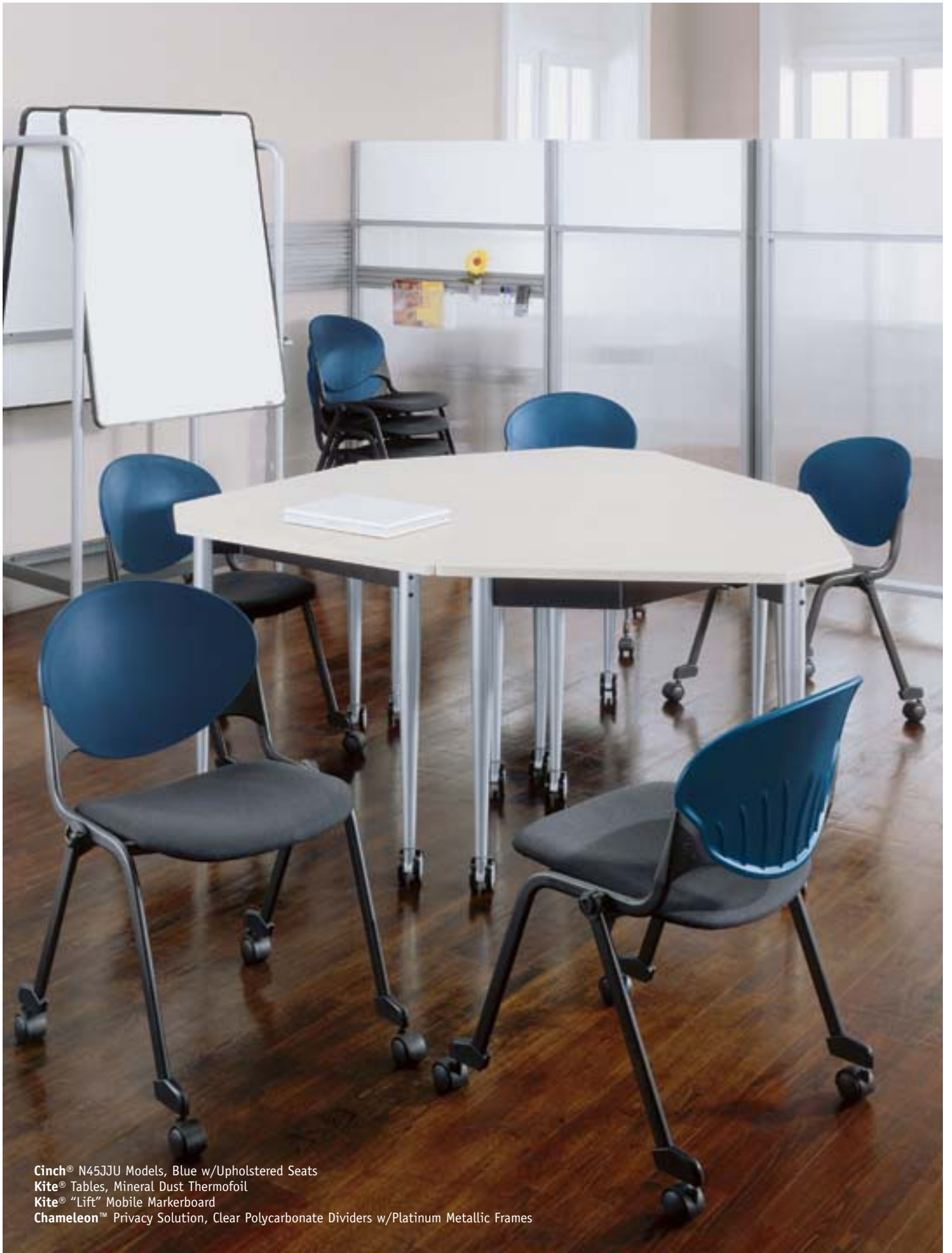
Cinch® N45JJU Models, Blue w/Upholstered Seats Kite® Tables, Mineral Dust Thermofoil Kite® "Lift" Mobile Markerboard Chameleon™ Privacy Solution, Clear Polycarbonate Dividers w/Platinum Metallic Frames