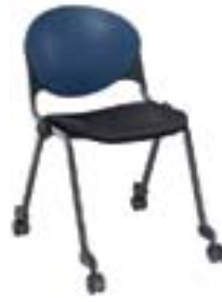
Blue w/Upholstered Seat N45JJU w/Casters N45BBU