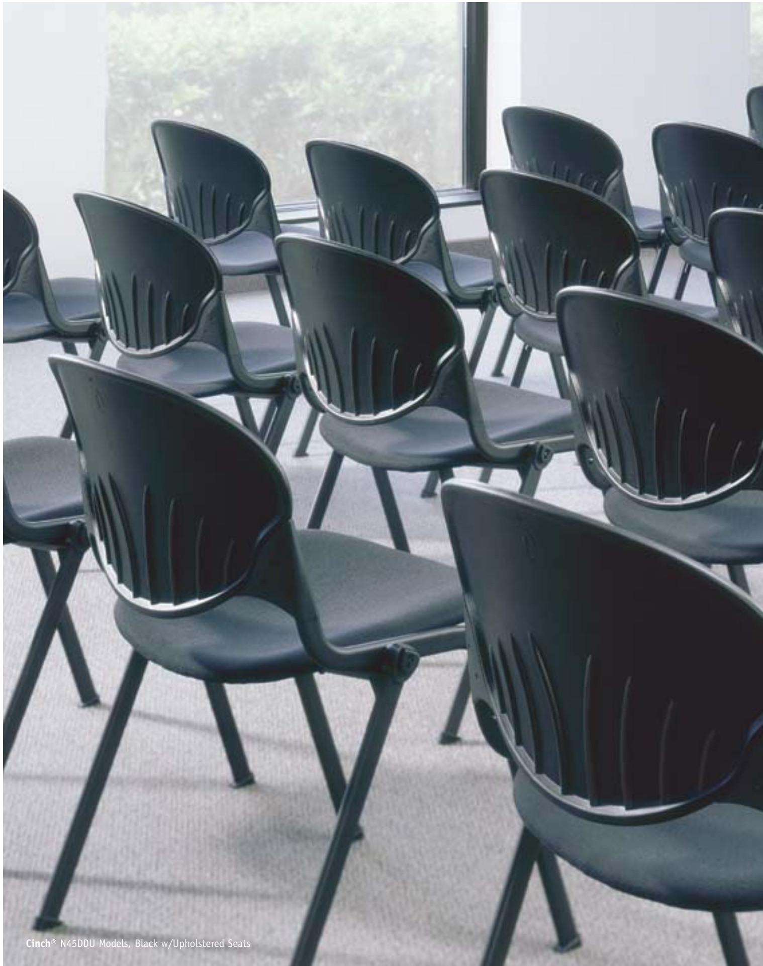
Cinch® N45DDU Models, Black w/Upholstered Seats