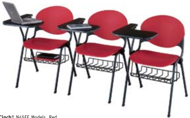
Cinch® N45EE Models, Red

Equipped with optional oversized tablet arms and bookracks that add convenient under seat storage.