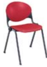
Red N45EE N45LL w/Casters