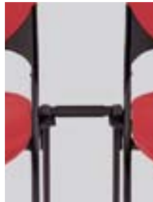
Optional Ganging Bracket Bracket gangs non-mobile arm, armless or tablet arm models