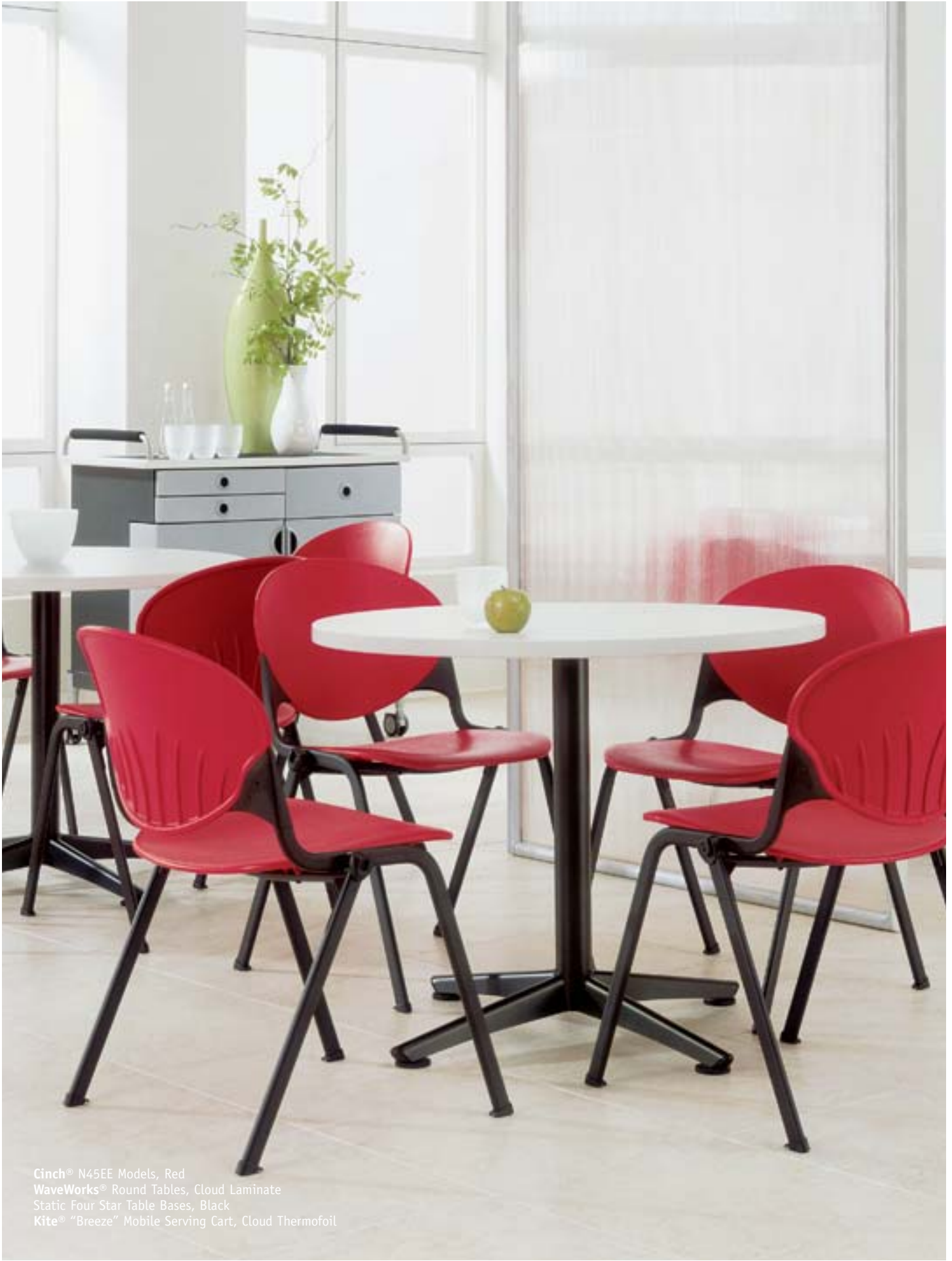
Cinch® N45EE Models, Red WaveWorks® Round Tables, Cloud Laminate Static Four Star Table Bases, Black Kite® "Breeze" Mobile Serving Cart, Cloud Thermofoil