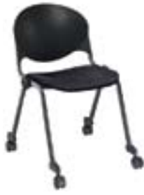
Black w/Upholstered Seat N45KLU w/Casters N45DDU