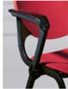
Optional Arms Easily install/remove with allen wrench