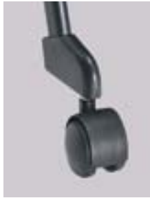
Casters Built-in safety feature requires weight to be placed in chair before casters will roll