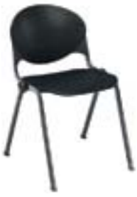
Black N45DD N45KK w/Casters