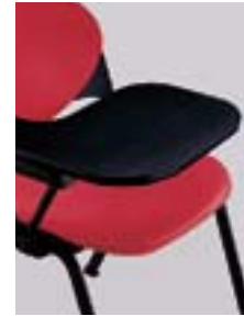
Optional Tablet Arm Laminated tablet arm tilts up for convenient storage (Not stackable)