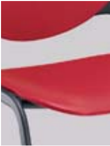
Plastic Seats Contoured, injection molded polypropylene seat