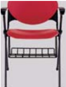
Optional Bookrack Adds convenient under seat storage for books and supplies