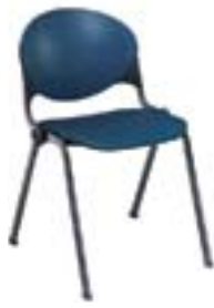
Blue N45BB N45JJ w/Casters